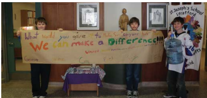
Above, a student puts the school's first donation into the school's communal jar.