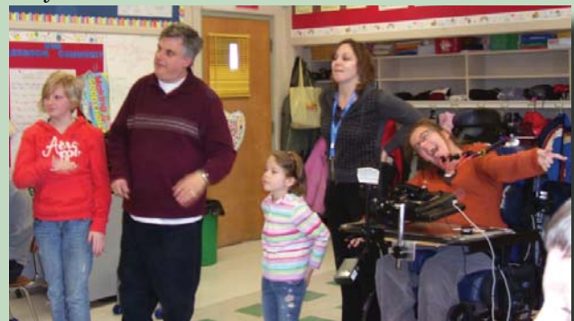
Students and staff look to build on relationships developed last year with people from Wingham Community Living that will be inspired by their vision.

“Brainstorming together will give us the tools to focus in on what’s important, so we can better articulate what we’re all about,” he says. “It needs to be ready, aim, fire , not fire, ready, aim . Defining what we believe and where we’re going is not just a one-shot deal. It’s an ongoing process in our Catholic schools.”