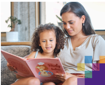
Parent and Caregiver Resource Guide: Supporting Knowledge & Skills in Managing Anxiety Using Storybooks